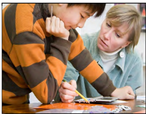
English Language Study

The International Winter Camp 2012 is a rigorous, exciting, and fun English Language Camp in McMinnville, Oregon located in the beautiful Pacific Northwest of the United States . The International Winter Camp 2012 is designed for students between 11 and 18 years old with the primary focus on English Language Study with American Cultural Study and Excursions and Activities!