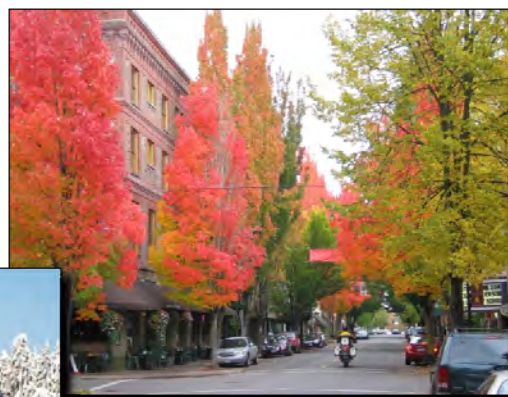
American Cultural Study